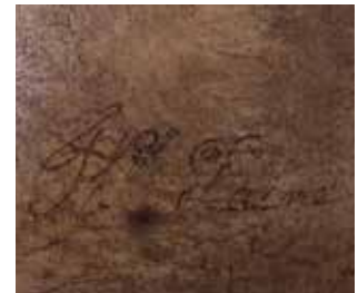
Cobbett's son inscribed Paine's name on the skull as shown above.