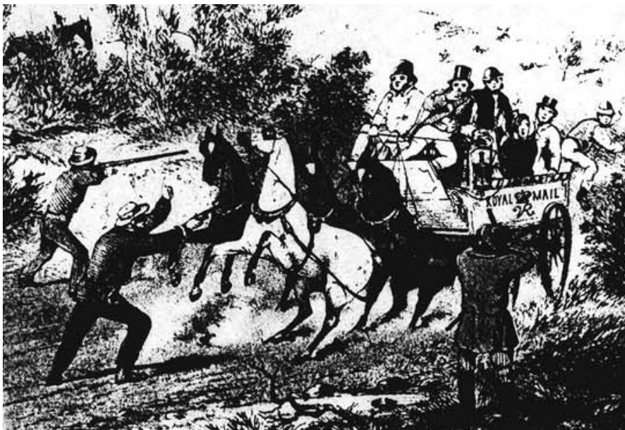
Plate 2. Bail up! Jew Boy Davis' gang terrorised the Upper Hunter district in 1840.

I reside at Maitland. Shortly before then I was Police Magistrate at Muswellbrook; on the 21 st December I was at Muswell Brook on my own private affairs; I received information on Sunday evening of twenty of a party of bushrangers being out and took steps to collect a party of men to go in pursuit. I started about seven next morning. I had ten mounted men and a black boy. I took the direction of Scone, and passed through it. I continued in pursuit till six that evening. I came up about fifty miles from Muswell Brook with the bushrangers, at a place called Doughboy Hollow. About half a mile off the road, we saw some drays encamped and some smoke; there were horses tethered and men in their shirtsleeves making a rush for the opposite side of the gully, where their encampment was. I saw about six or seven. We galloped in amongst them; a great many shots were fired on both sides. I can speak positively to Davis having fired at me; Davis rushed up from the gully, evidently to get behind a tree; whilst he was running I fired; he turned and fired at me. I was not more than twenty yards from him, he then ran towards a tree, and resting his gun in the fork of a tree, fired at me through the branches. I returned the shot, and