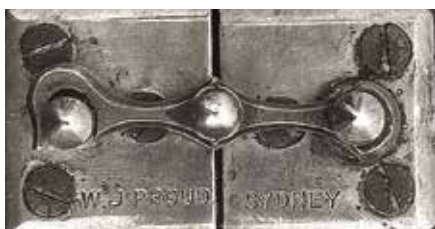
5B. Woodstock Challenge Cup, W J Proud Sydney marks to the front clasp of the oval cedar case, 1906.